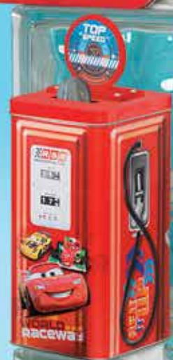
NEW Embossed BANK TIN 611907